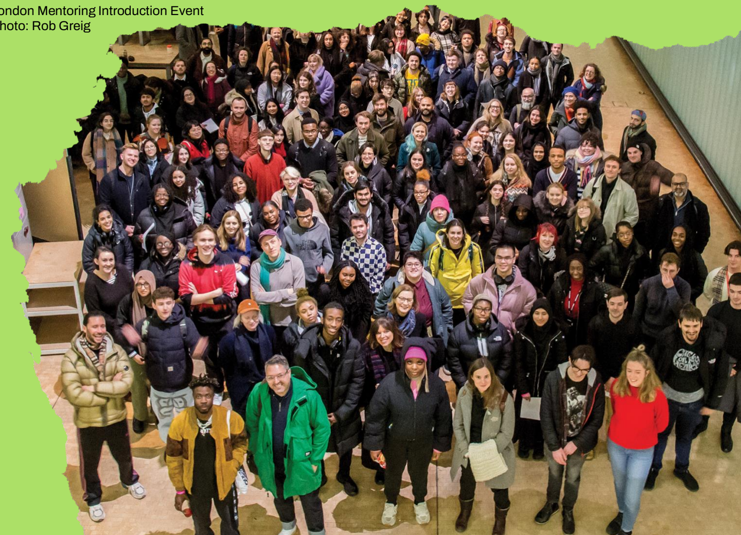
London Mentoring Introduction Event

We are committed to the employment and development of disabled people. We guarantee to interview anyone who identifies as disabled and whose application meets the person specification for a post. To be invited to interview, you must show in your application that you meet the person specification for the role. If you tell us that you have access requirements or any requests to make you comfortable, we can make reasonable adjustments to the interview process, and, if you join us, to your work arrangements.