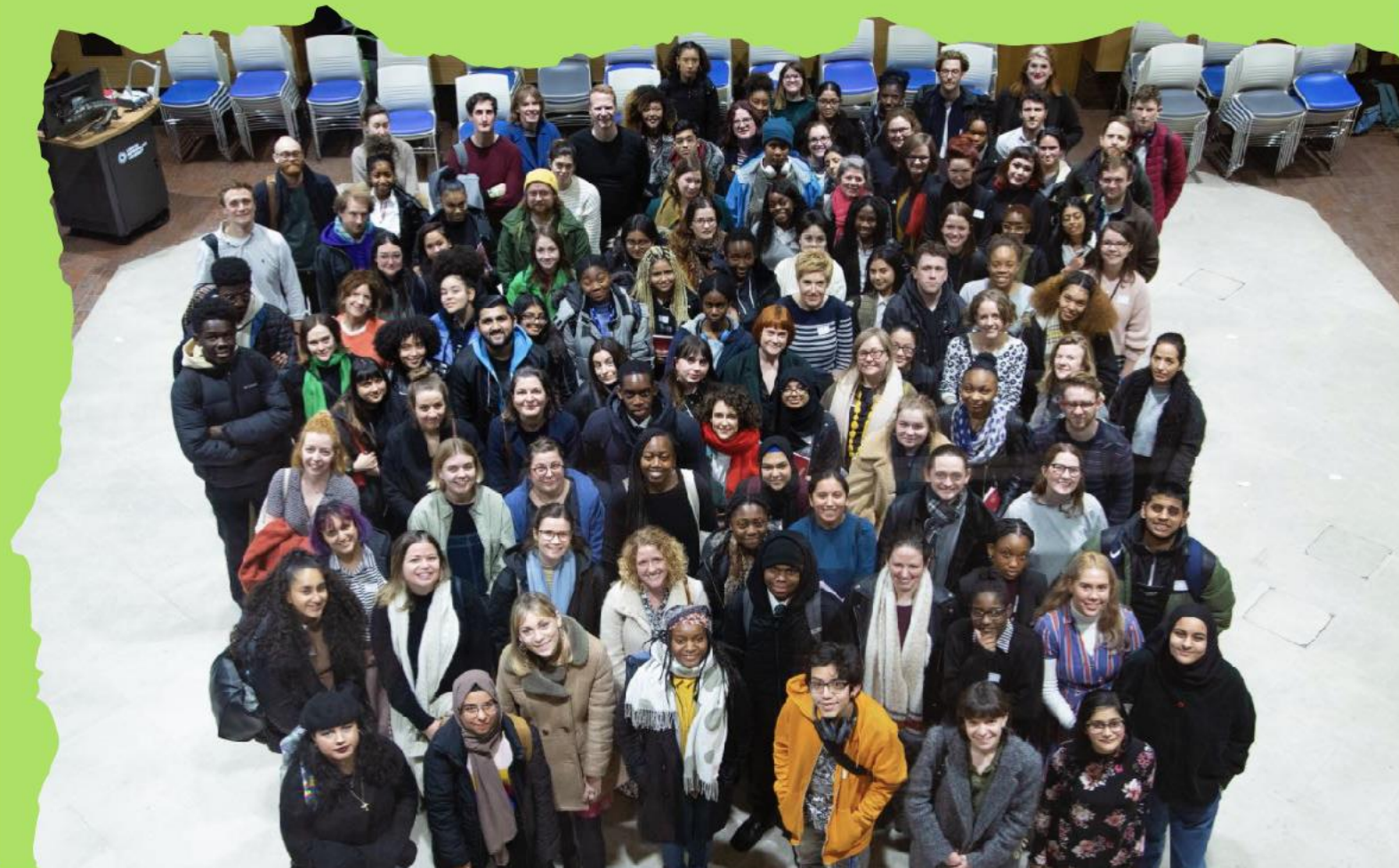
London Celebration Event.

We are committed to the employment and development of disabled people. We guarantee to interview anyone with a disability whose application meets the person specification for a post. To be invited to interview, you must show in your application that you meet the person specification for the role. If you tell us that you have a disability we can make reasonable adjustments to the interview process, and, if you join us, to your work arrangements. If you'd like to discuss any access needs or adjustments please get in touch.